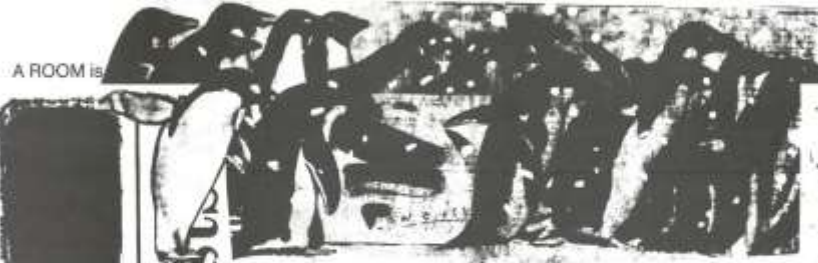
A ROOM is

WED. AND SAT. FROM 12-6PM. FLOOR 1, 446 GEORGE ST BRIS. Q 4000